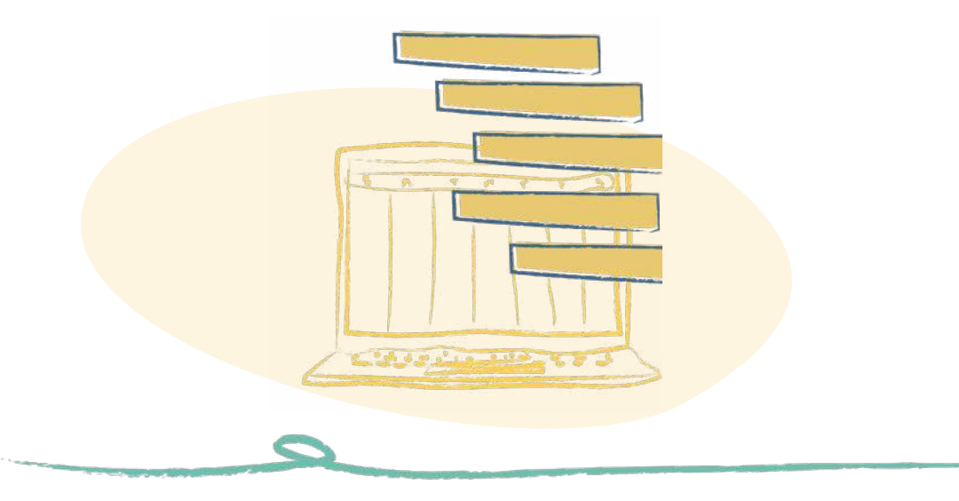
<sup>16</sup>Isabelle Kirkwood, "Hypercontext completes HR pivot with new Al-powered performance management tool," Betakit, July 20, 2023

Equip bosses with tools to have more productive and meaningful one-on-one conversations with Gen Zers. For example, an application developed for managers allows bosses and employees to create shared meeting agendas, integrate their meeting notes and track next steps. It also provides conversation starters on topics ranging from growth and development, performance, and motivation. A new Al-powered feature analyzes one-on-one notes and other data points to provide managers with high-quality performance reviews<sup>16</sup>.